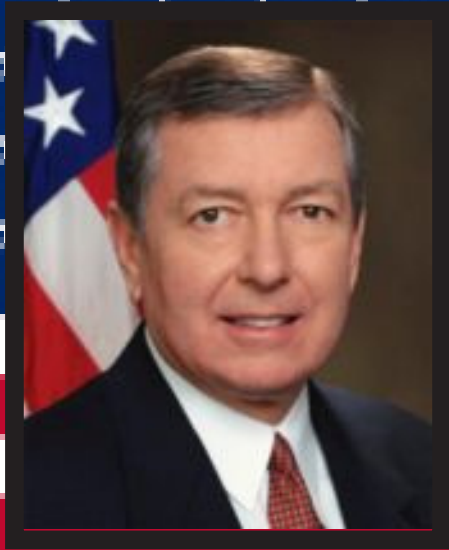
John David Ashcroft