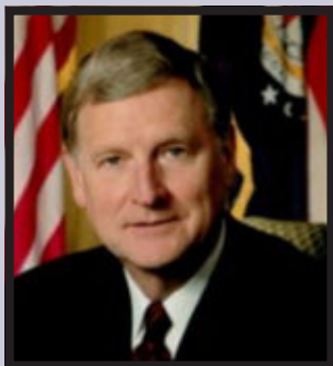
Former Governor Mel Carnahan

John Ashcroft's service as attorney general began with turmoil: a loss to a deceased challenger in his senate reelection campaign and a tumultuous confirmation battle. Then, on September 11, 2001, his job was transformed into the greatest leadership challenge any attorney general ever faced. Highly classified intelligence briefings, secret surveillance of terror cells, and war councils with President Bush gave Ashcroft